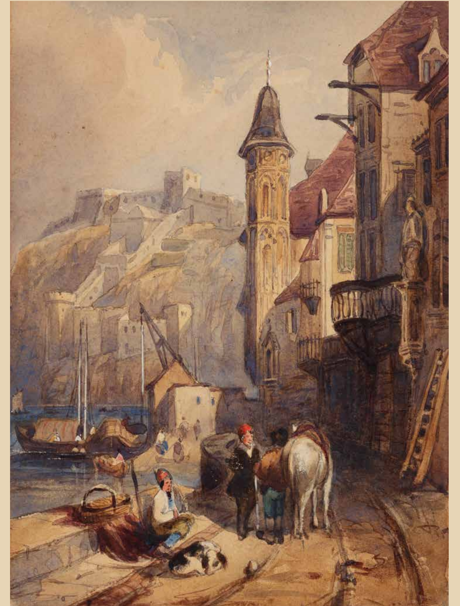
18. NEPOZNAT AUTOR / UNKNOWN AUTHOR Veduta Engleska, XIX. st. / England, 19th c. akvarel na papiru / watercolour on paper 16 cm x 11 cm ATM 697

ON THE BACKS OF THE TWO VEDUTE (FIG. 16 AND FIG. 18) there are rectangular printed stickers with truncated corners. The label on the ATM 696 (fig. 17) has been completely preserved, while a considerable part of the the upper and side parts of the one on the ATM 697 (fig. 19) has been torn off, but the text has remained legible, albeit incomplete. It can be read in its entirety from the preserved label as follows: PLAIN & ORNAMENTAL PICTURE FRAMES ELEGANT CHIMNEY & PIER GLASS FRAMES / HILLMAN, / CARVER & GIL-