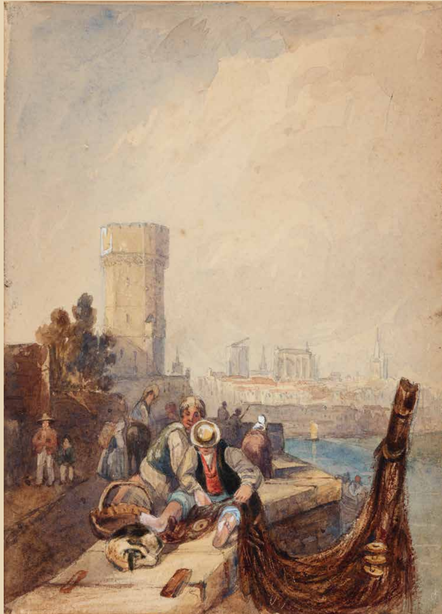
16. NEPOZNAT AUTOR / UNKNOWN AUTHOR Veduta Engleska, XIX. st. / England, 19th c. akvarel na papiru / watercolour on paper 16 cm x 11 cm ATM 696