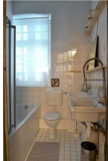
The Groundview | 68qm + 8qm Bathroom