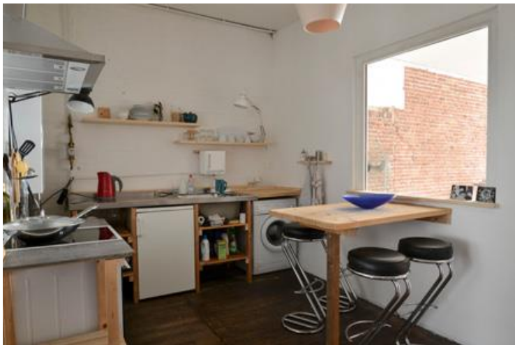
Bathroom (joint use)